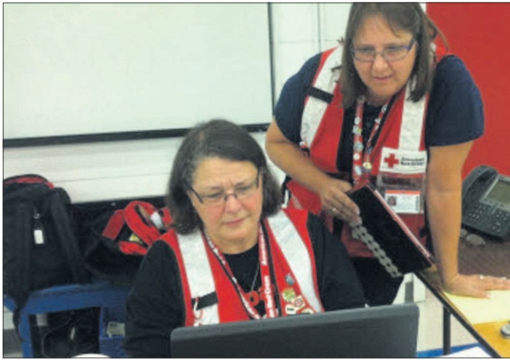
Members of the Cascade Red Cross. The Red Cross will be conducting training in Cannon Beach on March 30.

The Cascades region helps an average of three families each day who are affected by disasters, such as home fires and storms. After a recent home fire, the Red Cross opened a shelter so that 30 individuals displaced from their homes could have access to food, water, showers and an overnight stay.