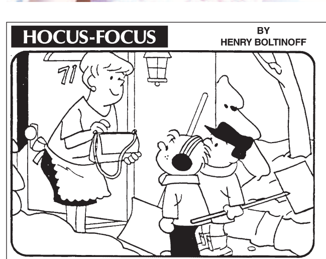
Find at least six differences in details between panels.