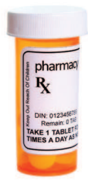
Medicine & Healthcare