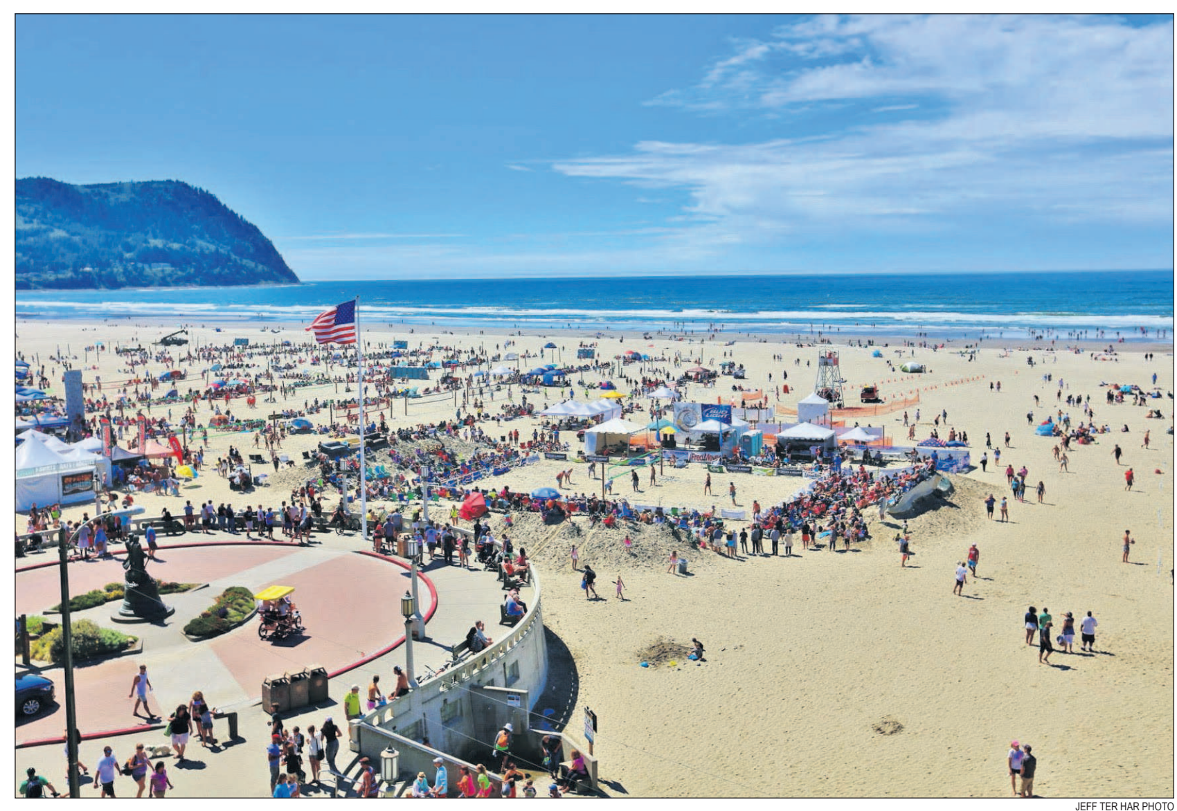
Over 3,000 players on 1,450 teams are expected to turn out this year for the 35th volleyball tournament staged on the beach at Seaside.

As for getting play to end earlier each evening, the chamber added an extra day to the event.