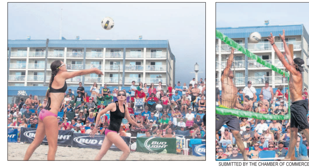
Since 2011, the Seaside Chamber Beach Volleyball event has been recognized by the World Records Academy as the largest beach volleyball tournament.

The doubles divisions include the majority of participating teams. Registration for the whole event may be down a little this year, "because families were used to