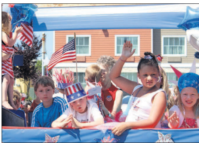
Seaside's 2015 Fourth of July Parade featured participants of all ages, including some youngsters riding on the float for Mrs. Tami's Daycare & Preschool.

Emails with additional parade information and assigned position will be sent out to registered entrants July 1-2.