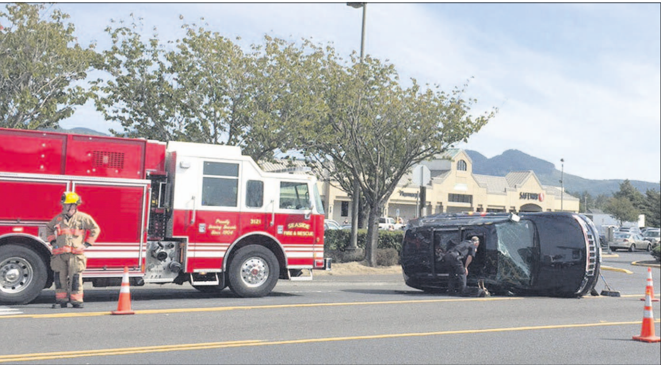
Emergency responders assist at the scene of a two-vehicle accident Wednesday on U.S. Highway 101 near Safeway in Seaside. One of the cars flipped on its side.