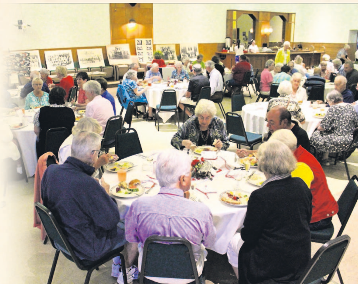
Dozens of former Seaside High School students gathered at the Seaside Elks Lodge on July 29 for a final reunion of the classes from 1941 to 1951.