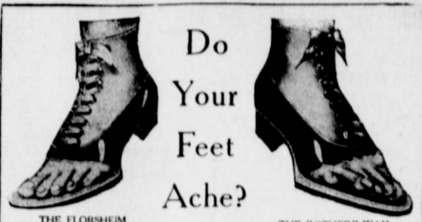
THE FLORSHEIM "NATURAL SHAPE" WAY THE "OTHER" WAY

Do Your Feet Ache? It's easy to diagnose your case—ill-fitting shoes.