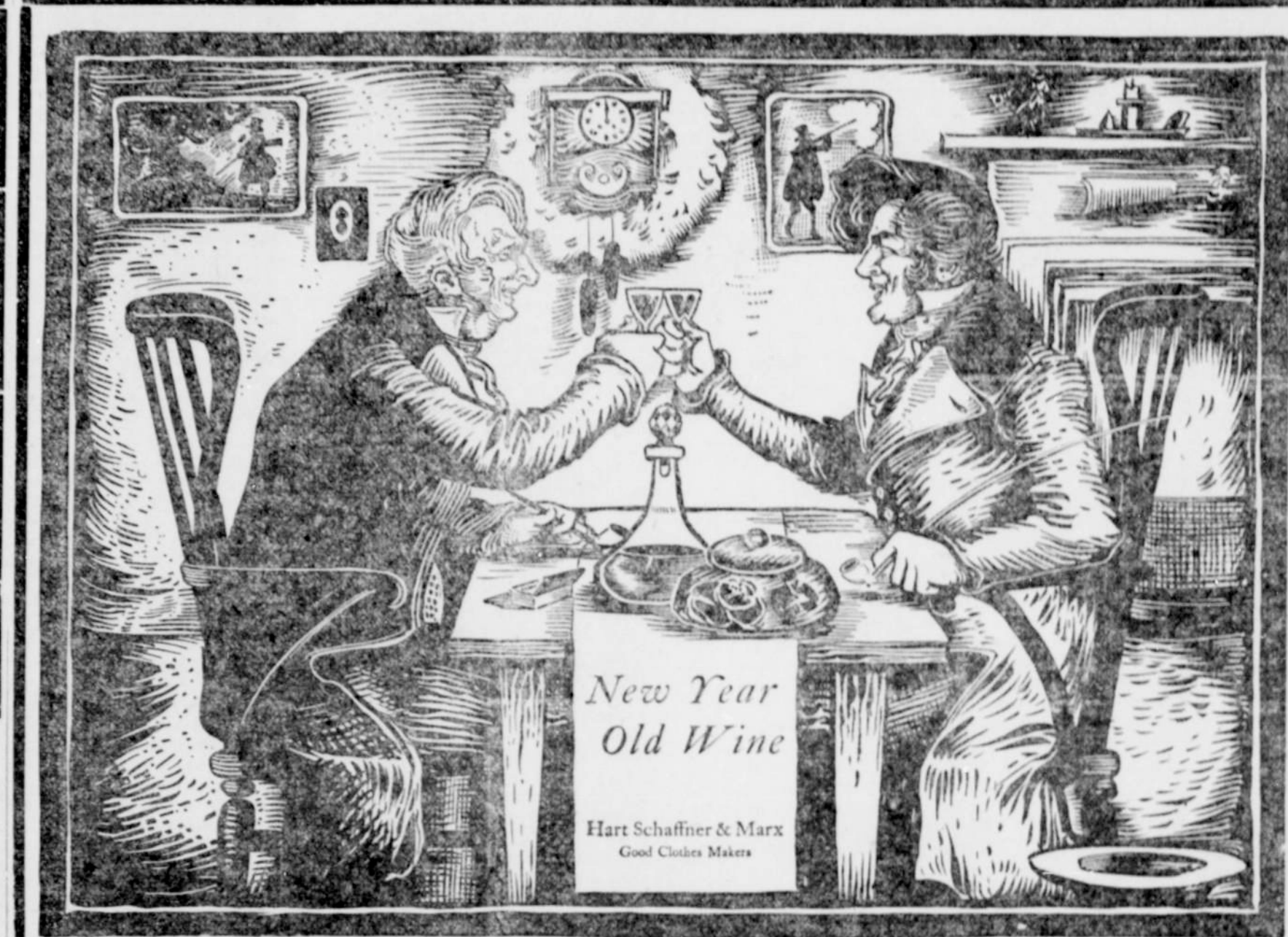
Copyright 1909 by Hart Schaffner & Marx