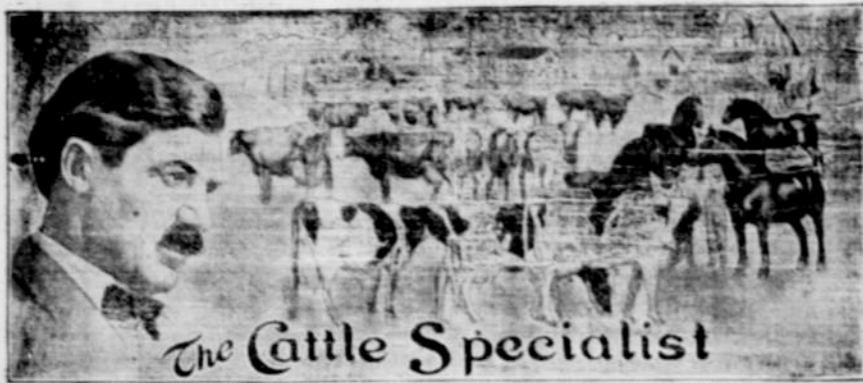
The Cattle Specialist