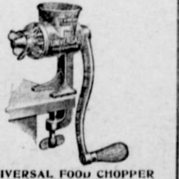
UNIVERSAL FOOD CHOPPER

The Big Four-Story "BRICK," Klamath Falls