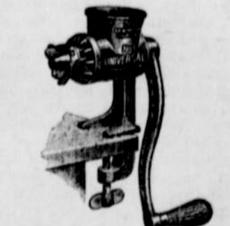
UNIVERSAL FOOD CHOPPER

The Big Four-Story "BRICK," Klamath Falls