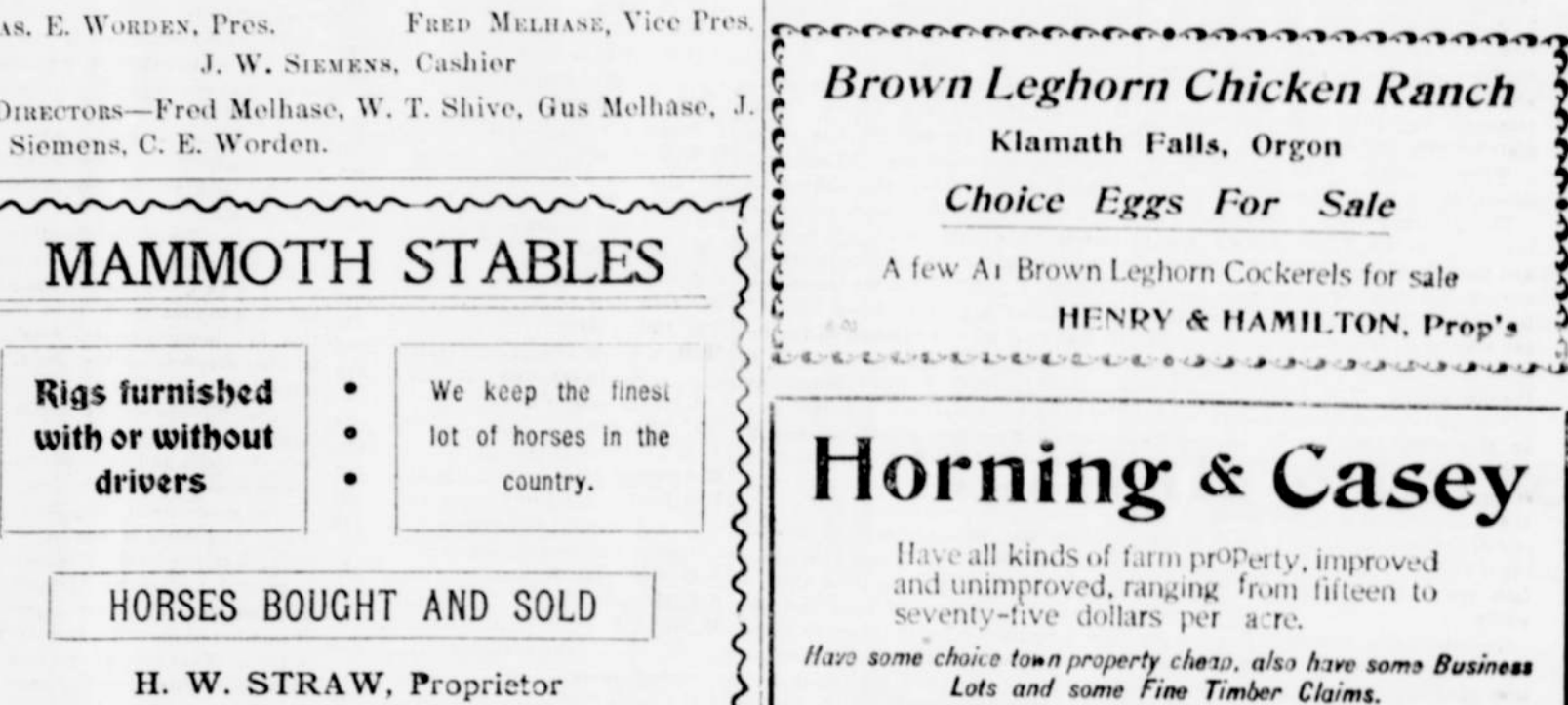
REAL ESTATE AND NOTARY PUBLIC