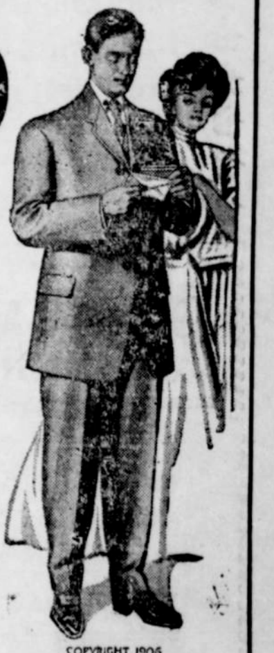
COPYRIGHT 1906 FRIEND BROS CLOTHING CO. MILWAUKEE