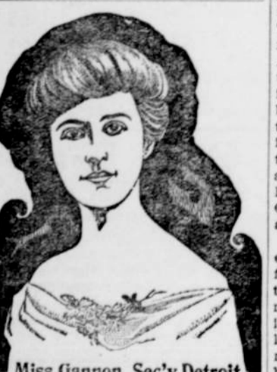
Miss Giannon, Sec'y Detroit Amateur Art Association, tells young women what to do to avoid pain and suffering caused by female troubles.

Milk and Water. Boston leads the big cities of the country in the use of milk, the daily average being 1.171 pints per capita.