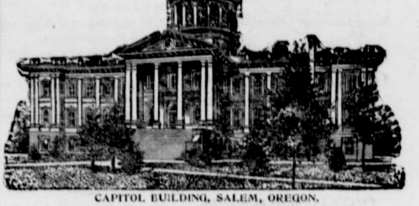
CAPITOL BUILDING, SALEM, OREGON.

Uses Pe-ru-na For Colds in His Family and Grip.