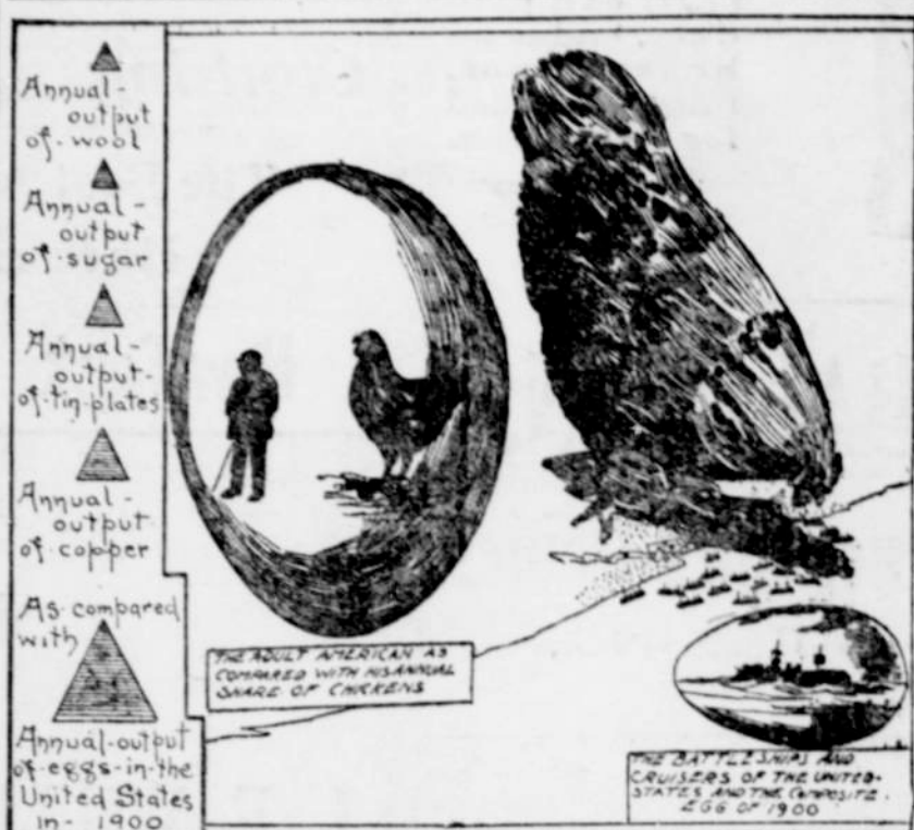
THE AMERICAN HEN IS A "BIRD."