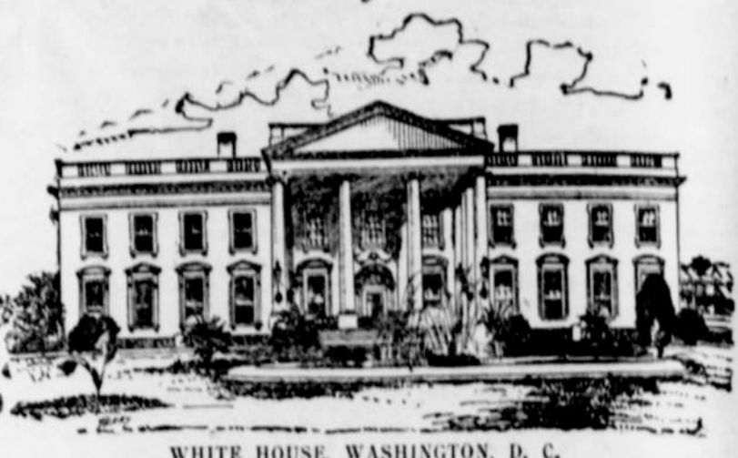
WHITE HOUSE, WASHINGTON, D. C.

A Venerable Lady of Noble Lineage Speaks a Timely Word.