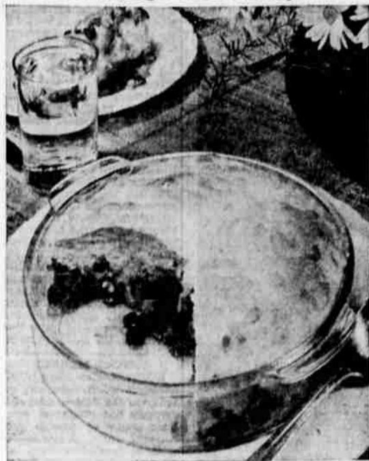
Nutrients guaranteed in this fresh vegetable shortcake.

THE fresh vegetable season offers budget nutrition and assorted flavor. Begin now to discover new ways of introducing more vegetables into the family menu.