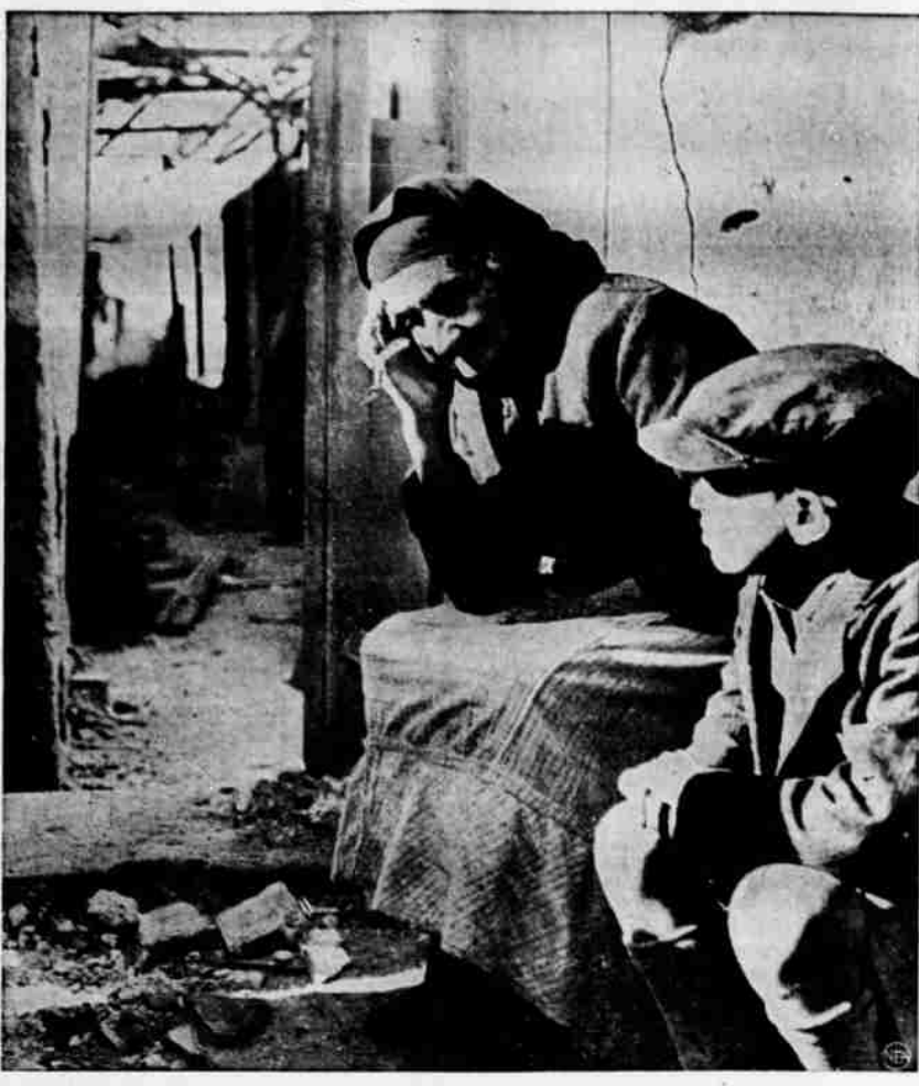
stoic face symbolic of the tragedy that now overshadows the glory of Greece, an aged woman beside the ruins of her home in Piraeus, Greek port battered by axis bombers. Beside her is a young boy, possibly her grandson, a hint of the hope that Greece will rise again.