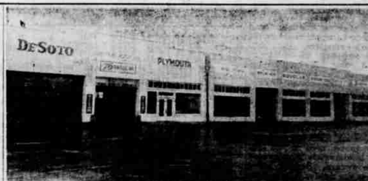
744-734-724 ENTIRE DOUGLAS MOTOR COMPANY SERVICE AND NEW CAR SALES DEPARTMENT

Only 100% Supreme All Chrysler Product Service Between Portland and Sacramento