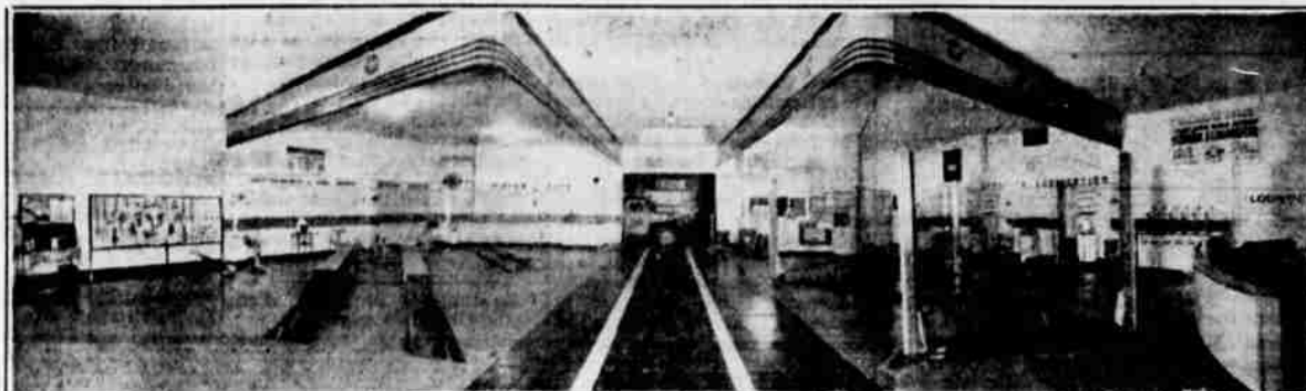
744 KLAMATH AVENUE, MAIN ENTRANCE TO OUR 100% SUPREME ALL CHRYSLER SERVICE DEPARTMENT

"WE'D like a chance to show you we deserve this award by giving you FINER SERVICE on your car"