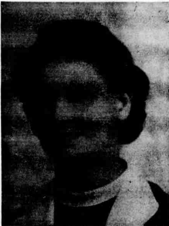
HOSTESS AT DANCE