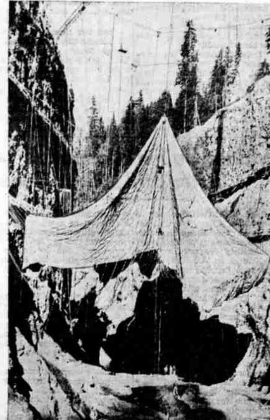
Holed over a flood-control dam project on the White river near Enumclaw, Wash., this big tent keeps men, tools and the site dry. Compare size of men at bottom of picture with tent, costing $35,000.