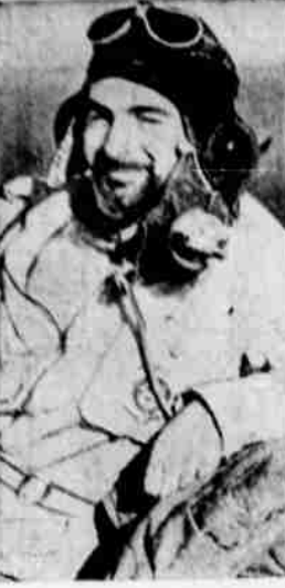
An R. A. F. pilot—looking like a modern version of Lawrence of Arabia—takes it easy after bagging three planes in Libya.