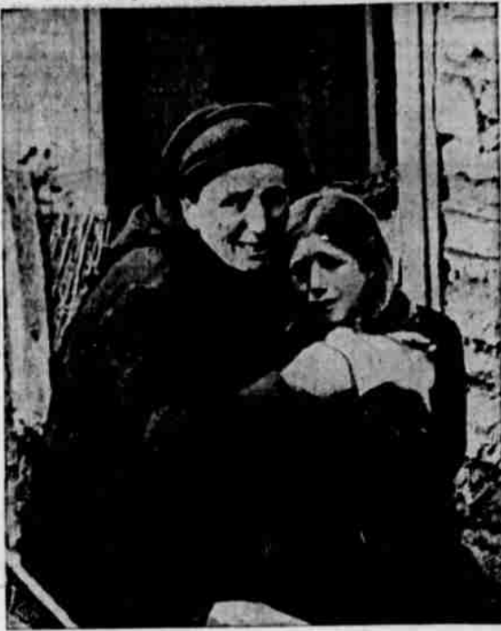
Terror is etched on faces of mother and daughter huddled together in Salonika, Greece, during bombing attack by Italian planes.