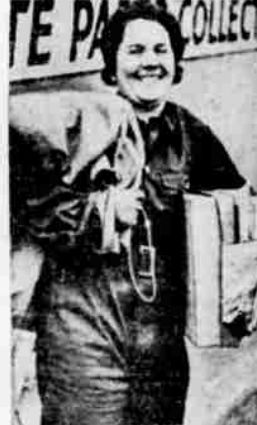
From housewife to junk collector . . . this British woman cheerfully salvages waste material to be made into war goods.