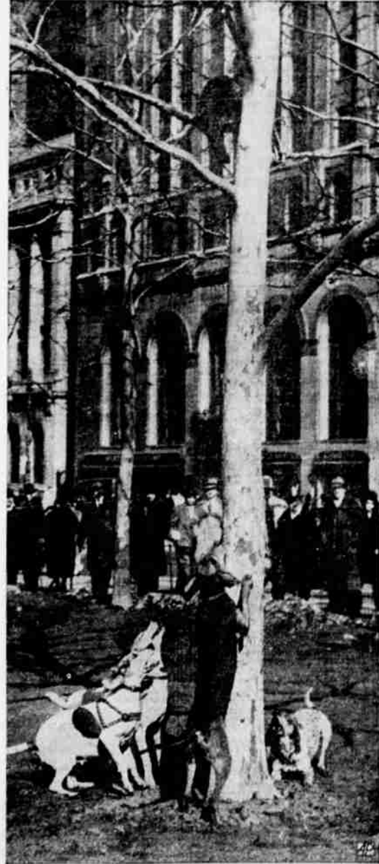
IT'S THE RIGHT TREE —Four bound dogs who knew better than to bark up the wrong tree, especially when a raccoon had lodged himself in this one, drew a good crowd in downtown Philadelphia—and while a sportsmen's show was on, too.

CLASSIFIED INDEX Apartments For Rent ..... 24 Automotive ..... 34 Business Opportunities ..... 48 Educational ..... 12 Financial ..... 46 For Sale or Trade ..... 38 General Notices ..... 4 Health ..... 13 Help Wanted, Female ..... 14 Help Wanted, Male ..... 16 Houses For Rent ..... 26 Livestock and Poultry ..... 44 Lost and Found ..... 2 Miscellaneous For Rent ..... 28 Miscellaneous For Sale ..... 36 Miscellaneous Wanted ..... 42 Personals ..... 6 Real Estate For Sale ..... 30 Real Estate Wanted ..... 32 Room and Board ..... 20 Rooms For Rent ..... 22 Situations Wanted ..... 18 To Exchange ..... 40 Transportation ..... 8 Services ..... 10