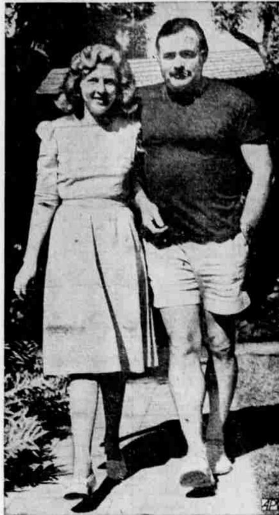
PACIFIC INTERLUDE —Comfort comes first with muscular, well-padded Ernest Hemingway, novelist, who strolls arm in arm with his recent bride, Martha Gellhorn, a magazine writer, in Honolulu. They're en route to the Orient.