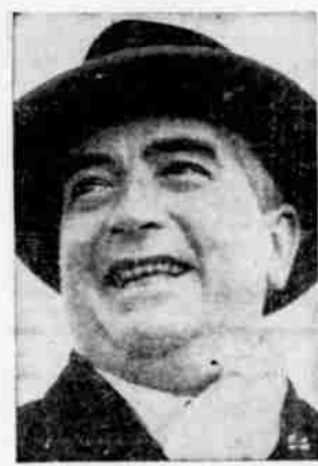
TRAVELS —Premier R. G. Menzies of Australia traveled 21,000 miles by air to get to London for defense conferences.