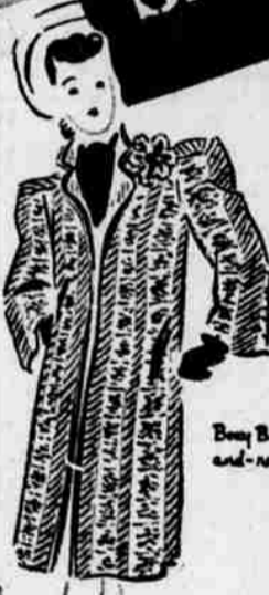
Beige Coat in wool and rayon lined 9 98

Not red, not brown, not russet, but the distilled "tang" of all three—that's Saddle-tones! Perfect seasoning for Beige! Picture them together in Coats, Dresses, Shoes, Hats, Handbags, Gloves... in Jackets, Skirts, Blouses... even Hosiery! Then come to Wards to mix yourself a perfectly-blended costume in the liveliest color duet of the season!