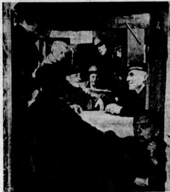
As Britain steps up tempo of blows against German-held English Channel ports, these men spend more and more time underground. They're sailors and land troops occupying an air-raid shelter while British planes are overhead.