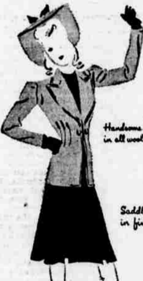
Handsome beige jackets in all wool flannel 3 98