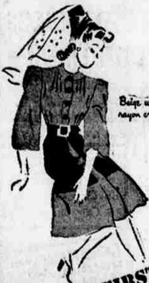
Beige with Saddle-tone rayon crepe dress 6 98

Ask for the new Rose to harmonize with this color duet 79¢