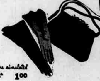
Saddle-tone simulated leather bags 1 00