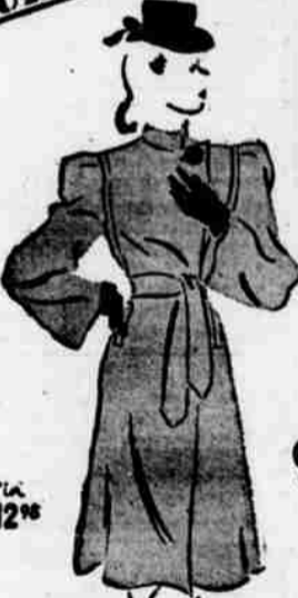
Fitted Beige Coat in all-wool fleeces 12 98