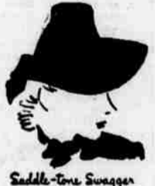
Saddle-tone Sweater Hat, creased crown 1 98