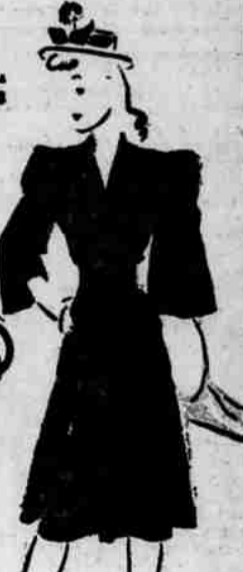
Beige casual with simulated snake trim 1 98