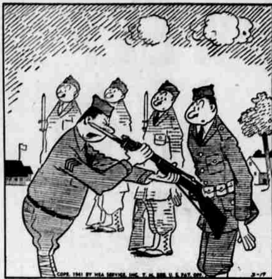
"Hm-mm, cork-tipped—a humanitarian!"