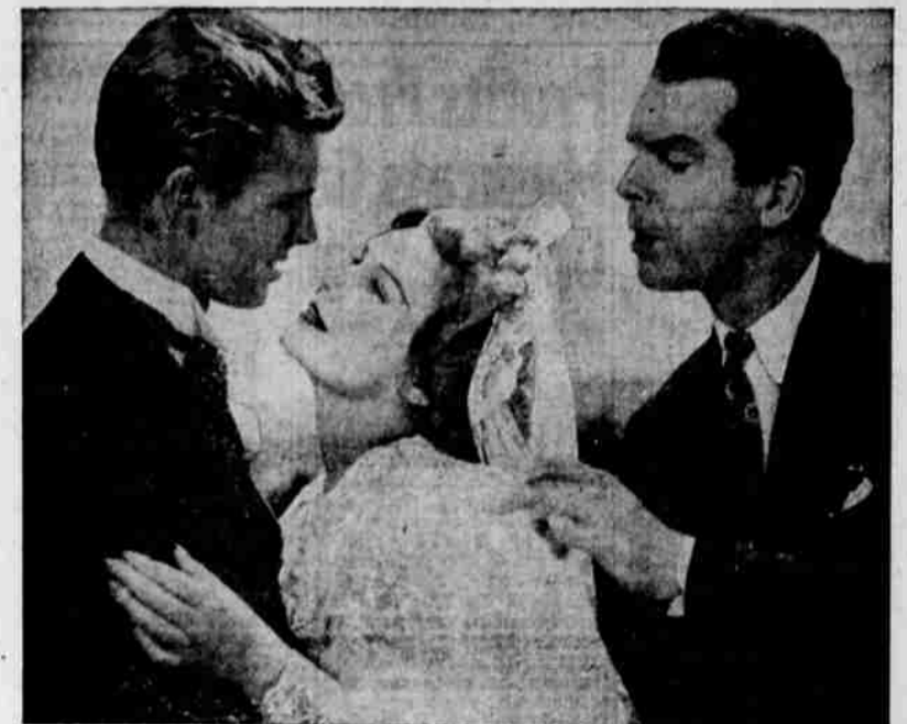
Stirling Hayden, Madeleine Carroll, Fred MacMurray in "Virginia" filmed in gorgeous technicolor starts Sunday for four days at the Esquire theatre.