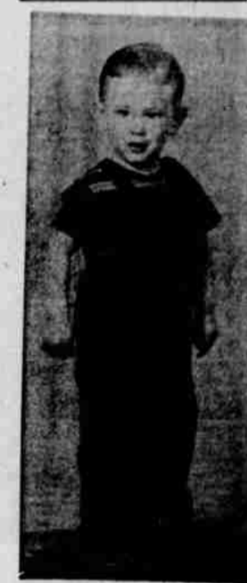
TWO YEARS OLD