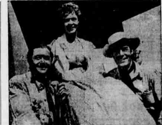
Robert Young, Virginia Gilmore and Randolph Scott are shown in a scene from the technicolor production of Zane Grey's "Western Union" which opens at the Pine Tree theatre Sunday.