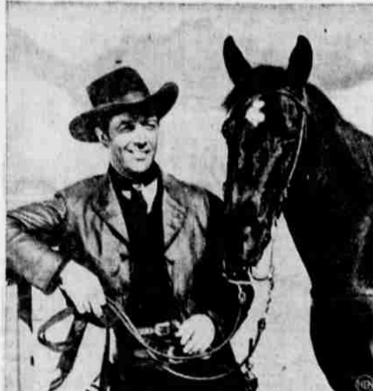
Even in dusty cowboy hat and leather jacket, Bob Taylor looks good. With six shooter on his hip, he's dressed fit, and ready, to kill for his first western role, that of Billy the Kid, famous outlaw. The lucky horse is "Lady," Bob's own black mare, which he rides in the picture.