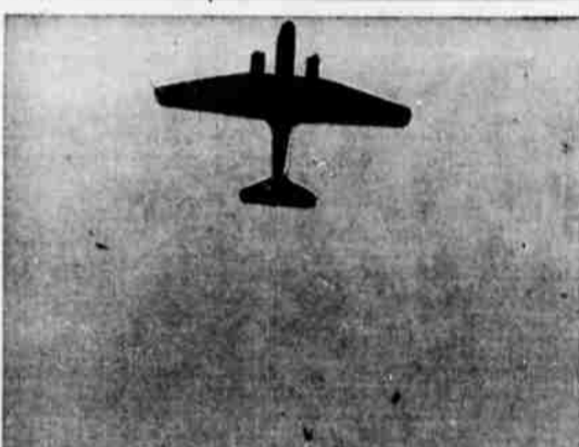
STAIRS TO STARS—Higher and higher climbs an army plane at Lakehurst, N. J., leaving behind army parachute students.

the hearing, and are required to file proof of their claims with the Clerk of this Court on or before the date of hearing, in the form and manner prescribed for proofs of claims in bankruptcy and stating whether or not the claimant accepts or rejects the proposed plan of composition.