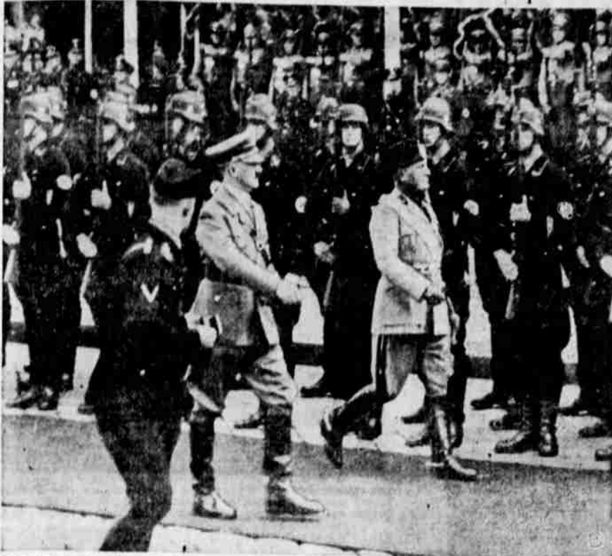
The first event on Premier Mussolini's program after arrival at Munich, Germany, to visit Adolf Hitler was scheduled as an inspection of the honor guard. But it is pretty hard to tell who was the most inspected, Mussolini or the guard. The Italian leader, right, accompanied by Hitler, strides briskly past the troops, who stand at the traditionally immobile "present arms." The passing glimpse wasn't enough for at least one soldier, however. Seen between Mussolini and Hitler, he snatches a peek at Il Duce's back.