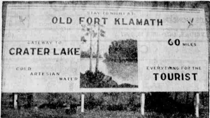
This sign has been installed on the highway near Dorris to inform travelers of the advantages of Fort Klamath.