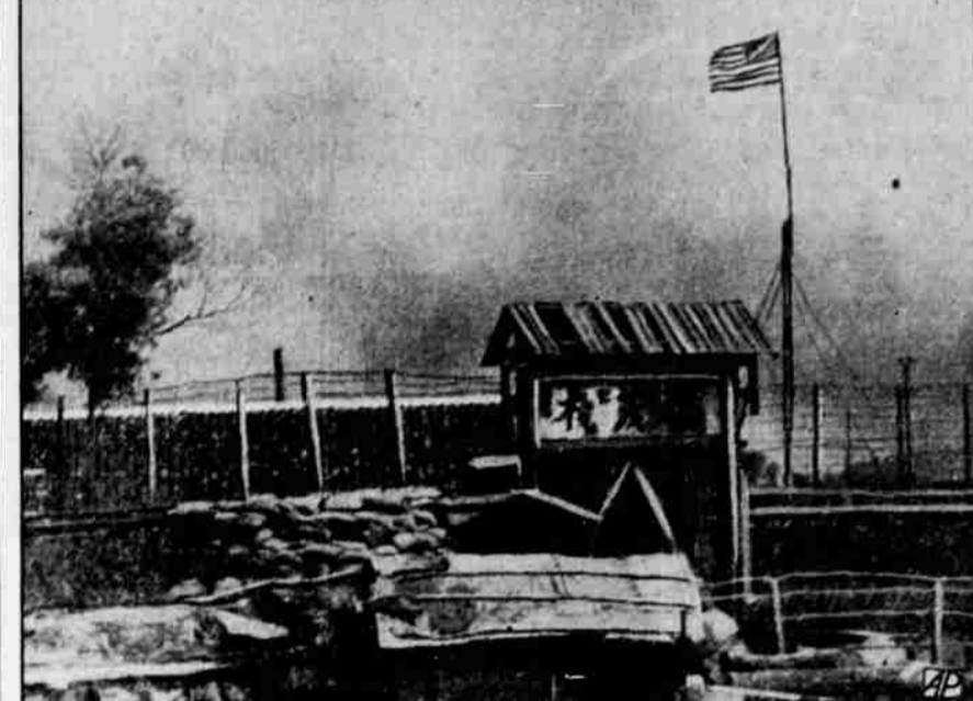
This small fragment of United States property over which flies the Stars and Stripes is located on the borderline of Shanghai's native quarter, Chapel, where some of the fiercest fighting of the Sino-Japanese war has centered. The section shows evidence of damage by shell and fire, while the sky in the background is filled with smoke from fires set by air bombs. In the foreground is a barricade of sandbags, to protect the property from invasion by panic-stricken Chinese civilians.