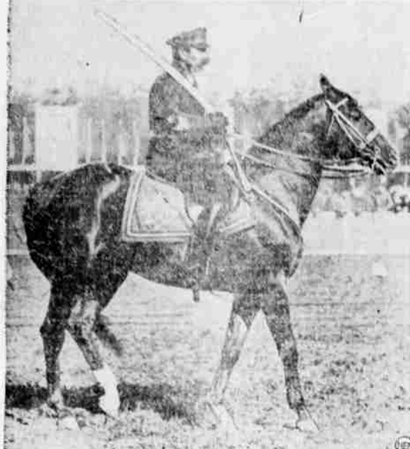
Only two of Russia's famous five marshals remain after recent "purges," and one of those is Marshal Simeon Mikhailovich Budenny, whose striking resemblance to Dictator Stalin is easily noticeable in this recent portrait in which Budenny carries a huge, unsheathed broadsword over his shoulder instead of the customary marshal's baton. Former chief of cavalry, Budenny is now in charge of the Moscow military district.