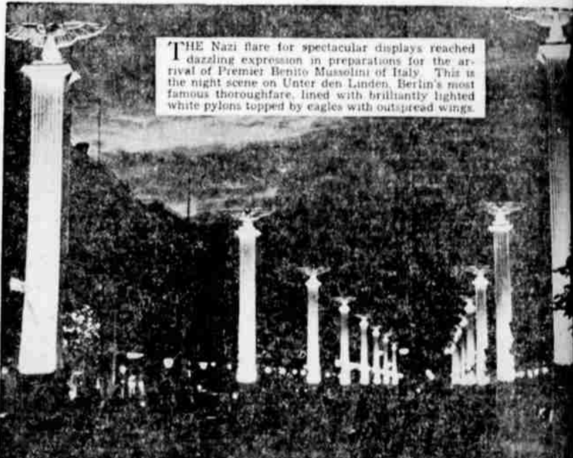
THE Nazi flare for spectacular displays reached a dazzling expression in preparations for the arrival of Premier Benito Mussolini of Italy. This is the night scene on Unter den Linden, Berlin's most famous thoroughfare, lined with brilliantly lighted white pylons topped by eagles with outspread wings.