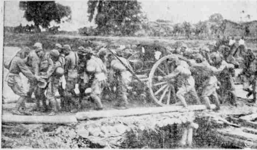
Now that a Japanese commander has given the affair in North China a name—"war"—the above can truly be depicted as a war scene in the conflict. Japanese soldiers are seen wheeling a field piece into position for firing on Chinese forces near Shanghai.

Japan War Guns Roll in North China Conflict Budenny Rides Out Soviet Purge