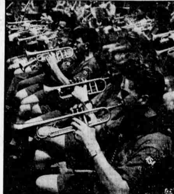
JAMBOREE BLOWOUT. Tootle! Tootle! Here's the 100-piece band from Region Four of Boy Scout-dom. They furnished one of the highlights for the Washington Jamboree. These Scouts are from Ohio, Kentucky, West Virginia and Virginia.

Temperatures often drop 16 to 20 degrees during a total eclipse.