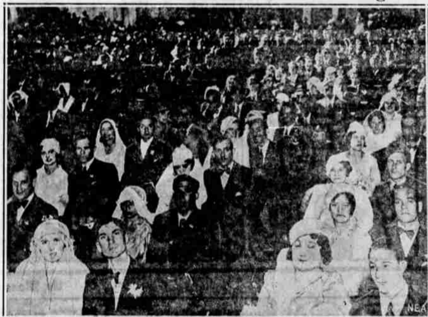
The wedding march was the popular tune of the day when 5,000 men and women were the principals in mass weddings throughout Italy, following the appeal of Premier Mussolini for more marriages and more children to repopulate the nation. In Rome 700 couples were married at their various parishes, and the brides and grooms here are pictured as they all assembled in the church of Santa Maria Degli Angeli for the celebration of a special mass.