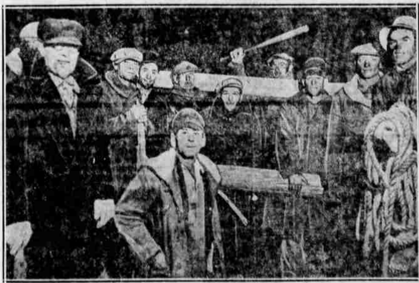
Road blockades, defended by resolute bands of farmers, face drivers of milk, produce and livestock trucks as they seek to reach markets in the farm strike zone. Above is shown a determined group, stationed at a barrier on the outskirts of Sioux City, Ia. Trains have been halted, livestock freed, and milk dumped in the outbreak, in which one man has been killed and several injured. Troops may be called in some sections.