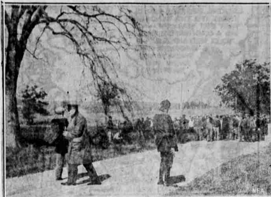
On one side of the tree stand deputy sheriffs withdrawn revolvers. On the other side, huddled in grim silence, stand striking farmers. This dramatic scene near Waukesha, Wis., typifies the tense situation in midwestern and northwestern farm regions where farmers threatened to continue striking until their demands are met at Washington.