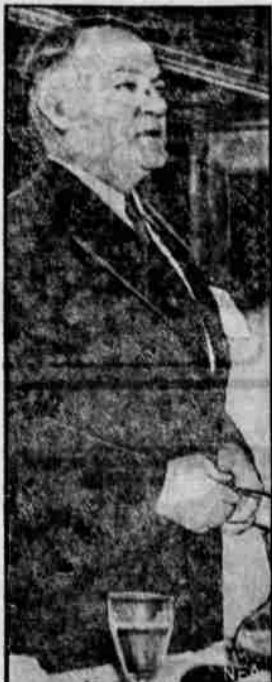
"The biggest imitation dead end thus far thrown by NRA foes is the one about freedom of the press," declared Gen. Hugh S. Johnson, opening his western campaign in Chicago, as shown above. "We have no right to license or censor newspapers," stated the NRA chief.