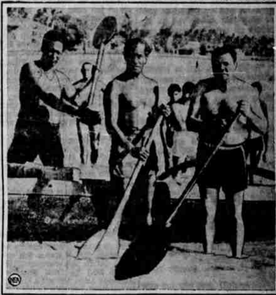
Few can tell Babe Ruth how to wield a bruising bludgeon, but when it comes to swining an outrigger canoe paddle, the Babe is not so hot. Above you see him, right, with Duke Kahanamoku, center, great Hawaiian swimmer, as he took a lesson in paddling at Waikiki Beach, Honolulu.