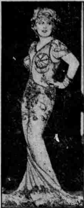
Of course, this is Mae West in one of her extremely revealing costumes, but the apparel isn't far from explying the lady's negligees she wears at home. Mae likes her frills as well as her curves.