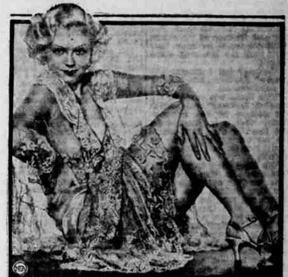
Don't let your mind stray far from your work, just because you happen to see pretty little Toby Wing, here, in gay negligee. Toby is one of the smartest youngsters in the film colony at Hollywood. She's one of Paramount's standbys.