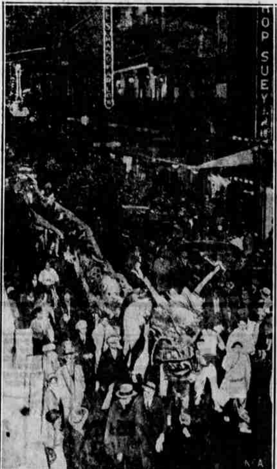
Chinatown just said "sic 'em" to its dragon and the depression was over! Celebration of the return of better days marked the famed Jade Festival in San Francisco, when the Great Dragon—150 feet long—made his first appearance since 1913. The monster is shown here as he was drawn through the streets, preceded by Chinese workers to cast out the evil spirits, in a spectacular night parade.