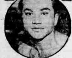
A romance that began when they met by chance in a Chicago physician's office will be climaxed by the wedding of Joan Abbott, above, of stage fame, and Barney Ross, below, champion lightweight pugilist—if reports started by their friends are true. Neither Ross nor Miss Abbott will confirm or deny the report.