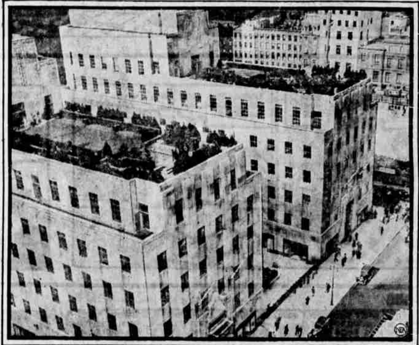
Verdant beauty of a country estate blends with the cold stone pile of the French building, Rockefeller Center, New York City, to form a horticultural masterpiece in the heart of the metropolis. Atop the sixth floor terrace roof, as shown here, a velvety lawn has been placed, shaded by trees, and flanked by yew hedges. The British Empire building, in background, has been landscaped in similar manner.