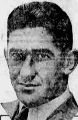
The report suddenly has started to make the rounds that Mickey Cochrane, above, great Athletics' basketball, will direct the destiny of the Detroit Tigers next season. Mickey has been said to be slipping with Mack's crew, which adds weight to the Detroit report.