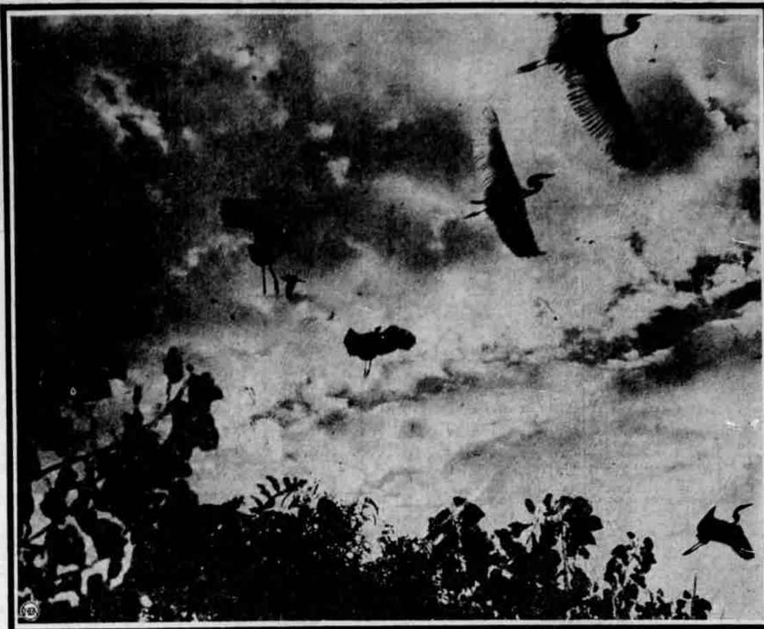
Fall dawns . . . and with the first glint of the sun on clouded skies that hint of winter, cranes take graceful flight from the misty marshlands of the North . . . answering the call of the Southland's lazy bayous.