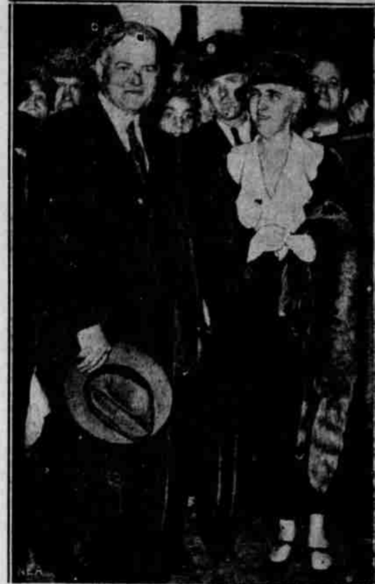
Smiling jovially and apparently in the best of health and spirits, former President Herbert Hoover is shown above as he arrived in Chicago with Mrs. Hoover to visit friends and see the Congress of Progress Exposition.