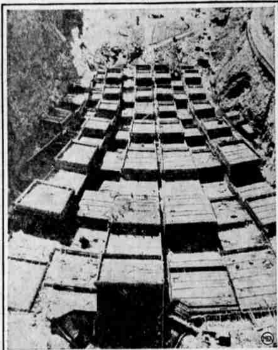
No, these aren't berry boxes piled in rows. They are sections of the foundations for Boulder Dam, the government's $165,000,000 hydroelectric project on the Colorado river. The size of the foundation works, which are built of concrete and steel, may be gauged by the small figures of men working on their surfaces.