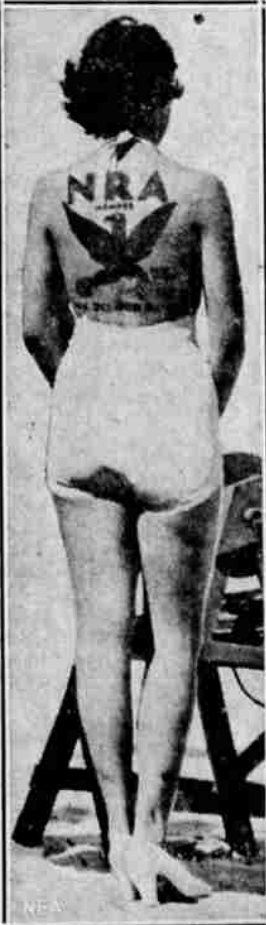
Just see what our "Blue Eagle"-eyed photographers discovered when he took a backward glance across a Florida beach.