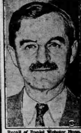
Recall of Daniel Webster Brown, above, for 17 years' Socialist mayor of Milwaukee, is being sought by taxpayers who say they hope in this way to bring about a reduction in taxes. Brown's friends assert that real estate dealers and speculators who are deluged in taxes are behind the movement.