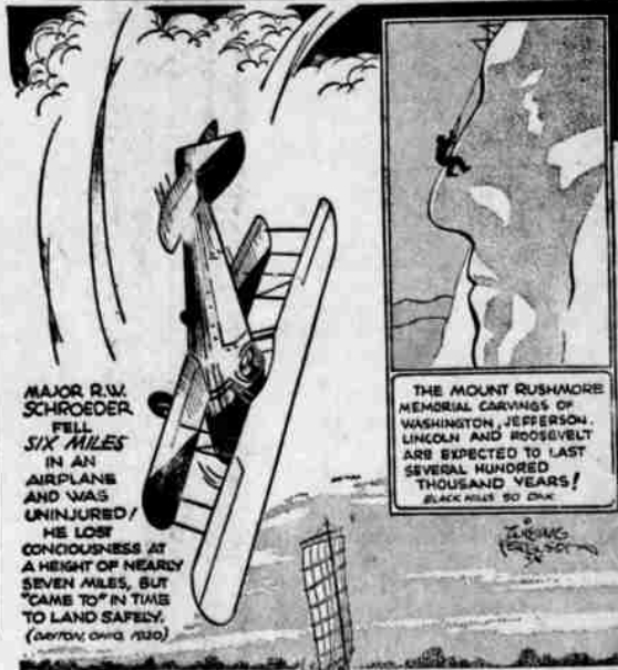
MAJOR R.W. SCHROEDER FELL SIX MILES IN AN AIRPLANE AND WAS UNINJURED! HE LOST CONSCIOUSNESS AT A HEIGHT OF NEARLY SEVEN MILES, BUT "CAME TO" IN TIME TO LAND SAFELY. (APRIL 24, 1932)