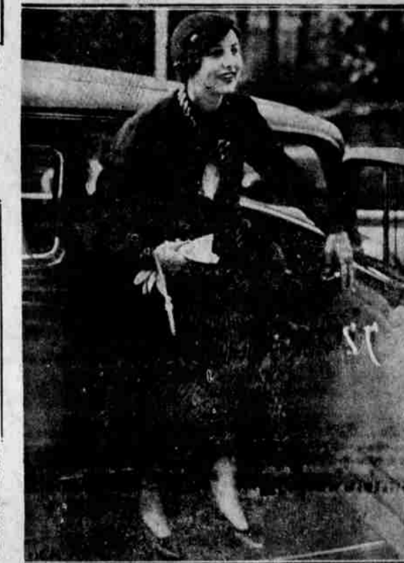
Certainly, I'll play again in tennis tournaments. I'm going to take the six months' rest prescribed, though," said Helen Willis Moody upon her return to San Francisco from the national tournament, where she defaulted to Helen Jacobs in the finals. "Under the same conditions, I'd do it again," she averred.