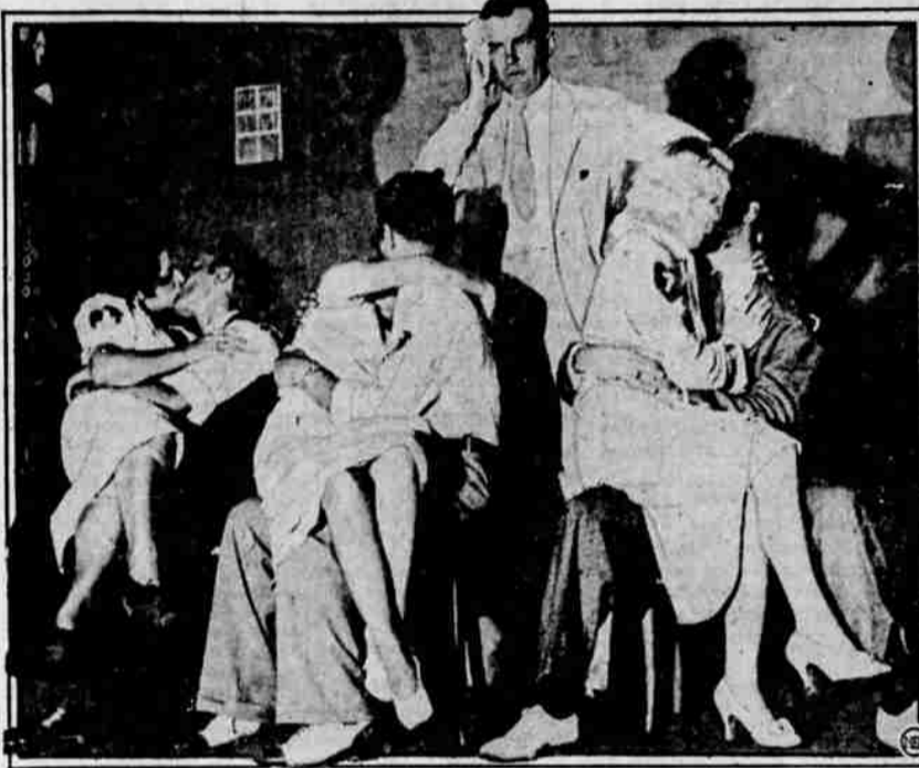
They're in a tight squeeze, to be sure, but these boys and girls didn't mind the spotlight and stares when they battled for honors in a kissing contest—the first ever staged—at Coney Island's Luna Park, in New York. They just did it for the love of it. Anyway, this was the scorching scene as the umpire cast an all-embracing glance over the field as the contestants passed the 30-minute mark.