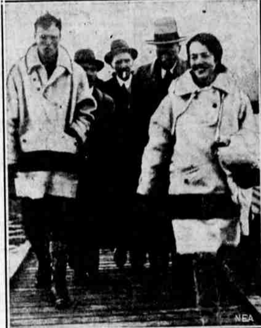
After an eventful flight over the North Atlantic from Greenland, Colonel and Mrs. Charles A. Lindbergh are shown as they arrived at Reykjavik, capital of Iceland, where they were greeted by a large crowd and officials of state and town.