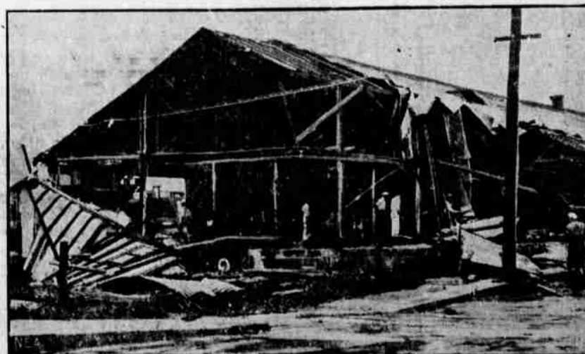
A hundred-mile-an-hour hurricane which struck the east coast of Florida and swept inland left damage like this in its wake, the above picture showing a wrecked building near West Palm Beach. Several persons were injured in the storm, which caused damage estimated at more than a million dollars.