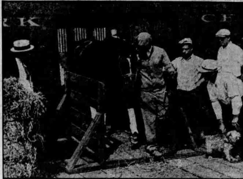
A special car from New York is carefully halted at Hawthorne race track and a half dozen valets and attendants snap to attention as Equipoise steps off. The picture shows the Whitney champion, his special hay, his dog and a few of the people who wait upon his wishes.