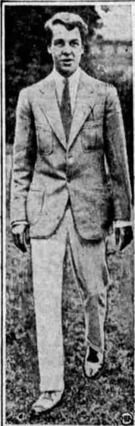
Alfred Gwynne Vanderbilt, above, shown here in a recent photo, will come of age Sept. 22 and into control of millions. His father, who died when the Lusitania sank, left him $2,500,000 of the fortune his family amassed in real estate and railroads and he'll share with his younger brother about $15,000,000 more.