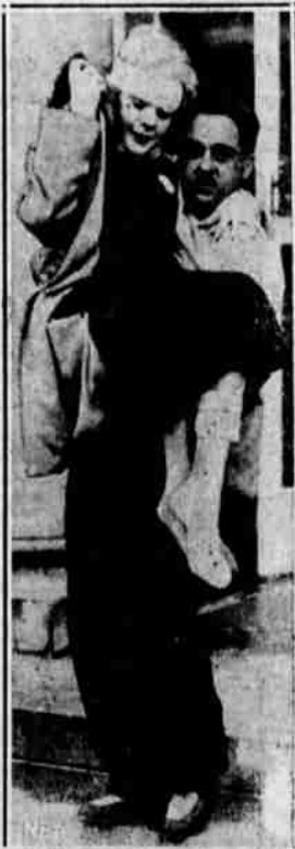
A passenger in Rudy Vallee's car when it overturned at Virginia Beach, Va., Miss Alice Faye, swathed in bandages, is shown here being carried from the Virginia Beach hotel as she left New York. Miss Faye, a singer in the Vallee orchestra, suffered a head wound and broken toe.