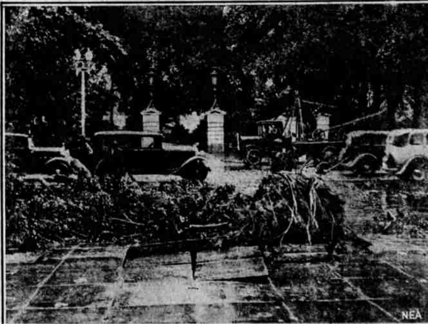
An idea of the severity of the gale that struck Washington may be had in this striking photo taken in front of the White House on Pennsylvania Avenue after a huge oak tree had been uprooted, pulling with it cement sidewalk blocks. Traffic was tied up for hours.