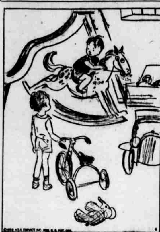
"I've really outgrown these things. I only play with them to keep in shape."