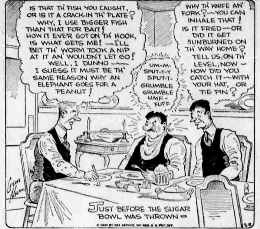
JUST BEFORE THE SUGAR BOWL WAS THROWN.