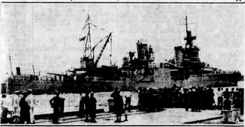
The new cruiser U. S. S. Indianapolis had an appointment with her Commander-in-Chief when she steamed out of the Philadelphia Navy Yard as pictured here after undergoing minor repairs. The Indianapolis is to meet President Roosevelt at Campobello Island, N. B., June 28, and carry him down the coast to the mouth of the Potomac for his return to Washington from his vacation.