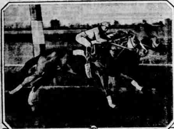
There'll be plenty of likely two-year-old winners when Arlington Park, Chicago, gets under way June 26. A half dozen sons of Reigh Count, 1928 champion, will be there to race for the first time. Above is Our Count, one of the sons, working out.