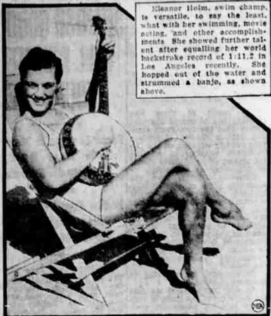
Eleanor Holm, swim champ, is versatile, to say the least, what with her swimming, movie acting, and other accomplishments. She showed further talent after equalling her world backstroke record of 1:11.2 in Los Angeles recently. She hopped out of the water and strummed a banjo, as shown above.