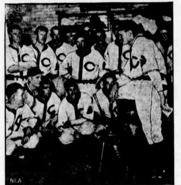
Calling the Cleveland Indians together in the clubhouse before they played their first game under his leadership, Walter Johnson, new pilot of the ball club, called for a "new deal" on the playing field. And Walter got it, for the boys went out and whipped the St. Louis Browns, 1-0, in 10 innings. Johnson is shown above, at right, with part of the team.