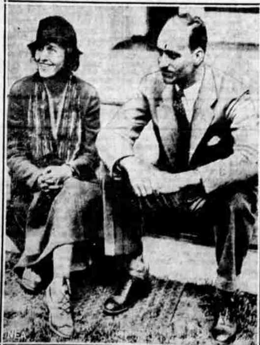
Fire which destroyed the roof of their summer cottage at Rye Beach, N. H., the day after they moved in, isn't going to be allowed to spoil the summer for Mr. and Mrs. James Roosevelt. Here's the President's son and his wife on the cottage steps, quite cheerfully resigned to their $5,000 loss. James branded as "crazy" rumors that he had received threats that their 14-month-old daughter, Sera, would be kidnaped.