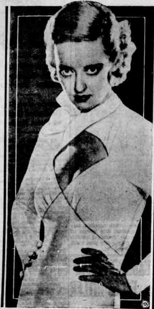
When it comes to registering honesty, Miss Bette Davis of the movies is considered the best Bette in Hollywood. The technique, as Miss Davis shows here, is to look your victim right squarely in the eyes, and then bare your soul. The costume is considered appropriate.