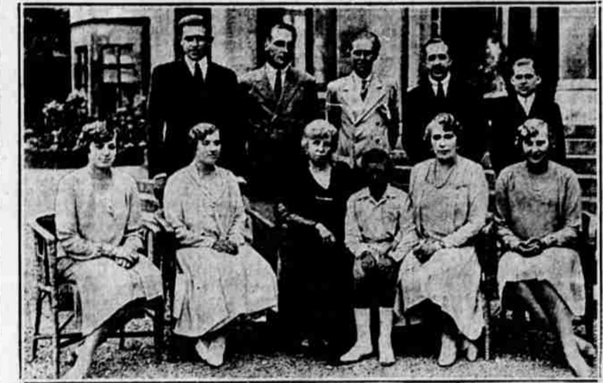
Swept from their thrones by the growing tide of Republicanism, the members of the former royal family of Spain are shown here in the most recent photo taken of them together, at the Palace of Miramar in San Sebastian. Their abdication ended 831 years of monarchic rule over Spain.