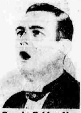
Caught Cold at Noon: Sang that Night!