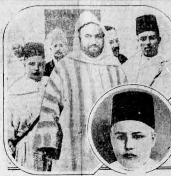
Following the death of his father, the beloved Moroccan sultan Moulay Youssef, the youngest son, Moulay Mohammed, 14, took up the first problem of state—what to do with the couple of hundred wives left by his father.