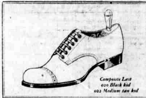
Composite Last 020 Black kid 022 Medium tan kid

All the comfort of an old shoe, all the good looks of a new shoe —might be a good slogan for Nettletons. $12.50 to $19.