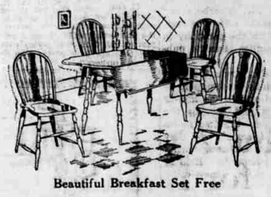
Beautiful Breakfast Set Free

— JUST THINK — WITH NO INCREASE IN THE PRICE OF THE TOLEDO RANGE— BUT BECAUSE OF THE FACT THAT WE MUST CLEAR THESE STOVES IN A SHORT TIME